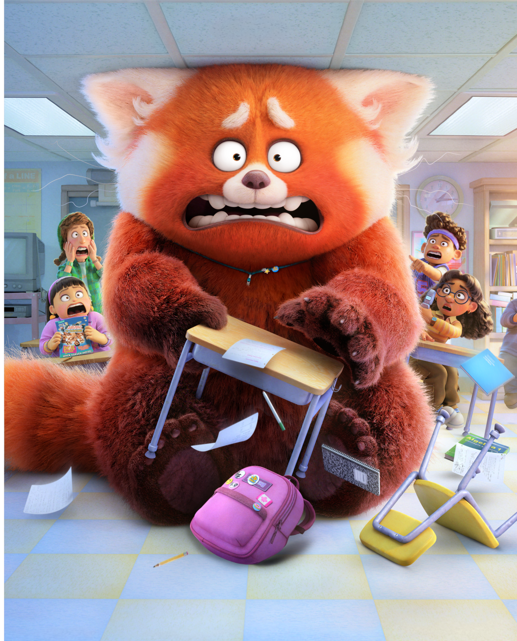
1. Wall clock 2. missing top magazine 3. missing green book 4. pencil on floor 5. upside down magazine 6. missing desk right 7. Backpack backwards 8. missing paper top right 10. Missing person left